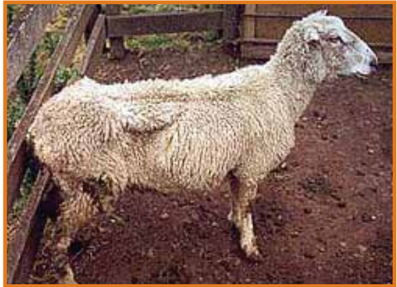
A sheep showing symptoms of Johne's disease.

Since the signs of Johne's disease are similar to those for several other diseases—parasitism, dental disease and caseous lymphadenitis (CLA), laboratory tests are needed to confirm a diagnosis.